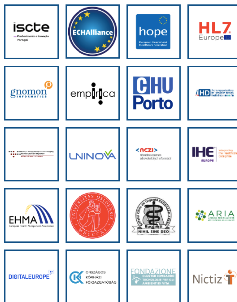
Figure 3: Partners page