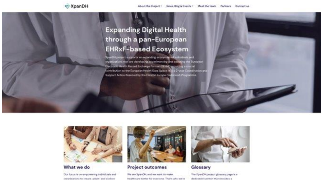
Figure 1: Home – landing page

The following visuals present the website as on 15 May 2023: